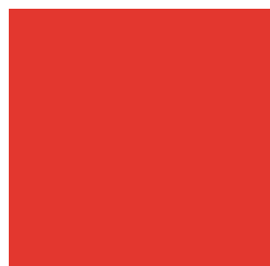
38888PFX Epic PF Orange

Wilflex™ Epic™ MX Color Mixing System offers 17 translucent to semi-opaque intermixable colors with a matte finish. This easy-to-mix color mixing system creates Pantone®-simulated colors for high production screen printing runs.