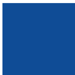
98886PFX Epic PF Fluorescent Blue