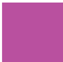
98885PFX Epic PF Fluorescent Purple