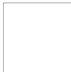
11888PFX Epic PF Mixing White