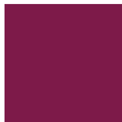
48889PFX Epic PF Magenta