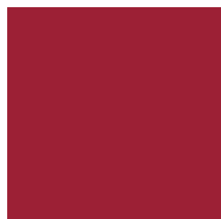
48888PFX Epic PF Red