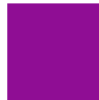
P11048 Fluo Violeta