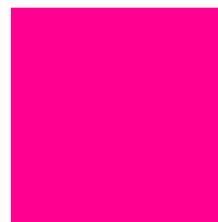
P11049 Fluo Fucsia