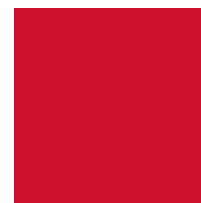
P11038 Rojo Np